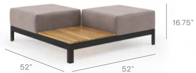
Diagonal Coffee Table Ottoman Combo 2204-D