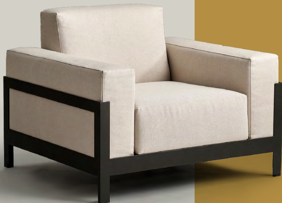
More Comfort Lounge Chair by Clodagh for Walters