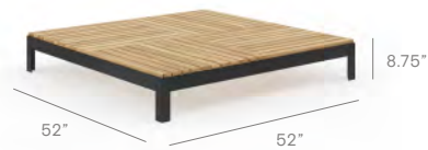
Large Coffee Table 22012-52