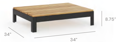
Coffee Table Corner Infill 22011-34