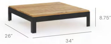
Coffee Table Infill 22011-26