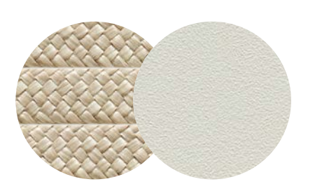
Flat Rope: Ivory (FX38) Metal: Pearl Sand (M41)

Select from our designer curated options below