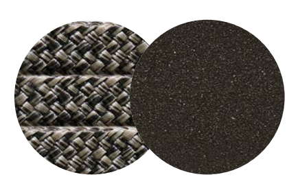
Flat Rope: Charcoal (FX22) Metal: Black Sand (M4)