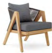
Dining Chair | 201 W 26" D 31" H 58.5" SH 18.5"