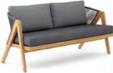
Loveseat | 2018 W 66.8" D 29.5" H 58.5" SH 18.5"