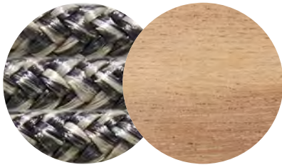
Round Rope: Charcoal 5mm (RX22) Wood: Unfinished Teak (T7)

Select from our designer curated options below