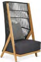
High Back Lounge Chair | 2033 W 32" D 33.4" H 59" | SH 17.5"