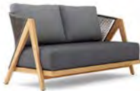
Sofa | 205 W 67" D 32" H 30.4" | SH 16"