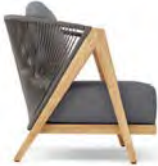
Lounge Chair | 203 W 31" D 32" H 30.4" SH 16.3"