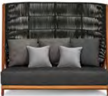
High Back Sofa | 2053 W 67" D 31" H 59" SH 17.5"