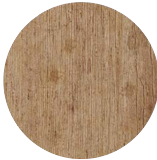
Unfinished Teak - 6 Months