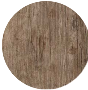
Unfinished Teak - 1 Year