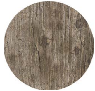
Unfinished Teak - 2+ Years