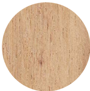
Unfinished Teak - New