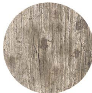
Unfinished Teak - 1 Year