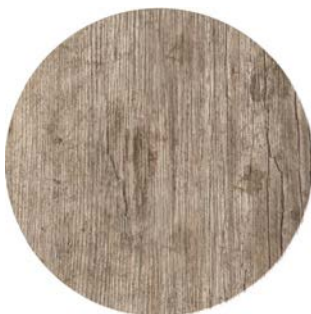
Unfinished Teak - 6 Months