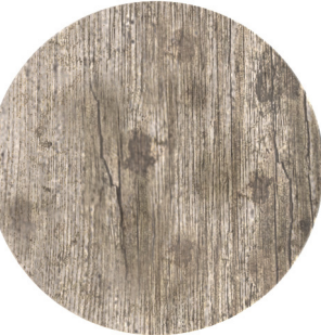
Unfinished Teak - 1 Year