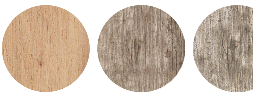
Unfinished Teak - New