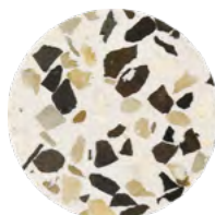
S18. Beige Terrazzo