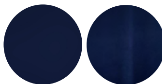
S25. Admiral Solid