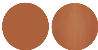
S23. Tiger Solid