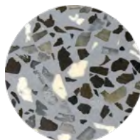
S19. Grey Terrazzo