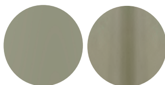
S24. Fern Solid