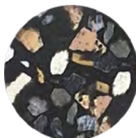
S20. Black Terrazzo